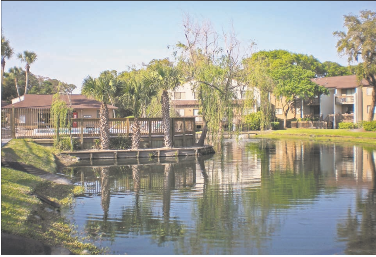
One of last year's Communities of Excellence winners was the Forest Ridge Village Condominium Association in Fernandina Beach. It won for best small association in the category of safety and security. Built in the early 1980s, the community consists of 104 residences in a mix of townhouses and garden-style condos.

There is no cost to submit an entry and communities may enter in multiple categories. The deadline for submissions is Jan. 15.